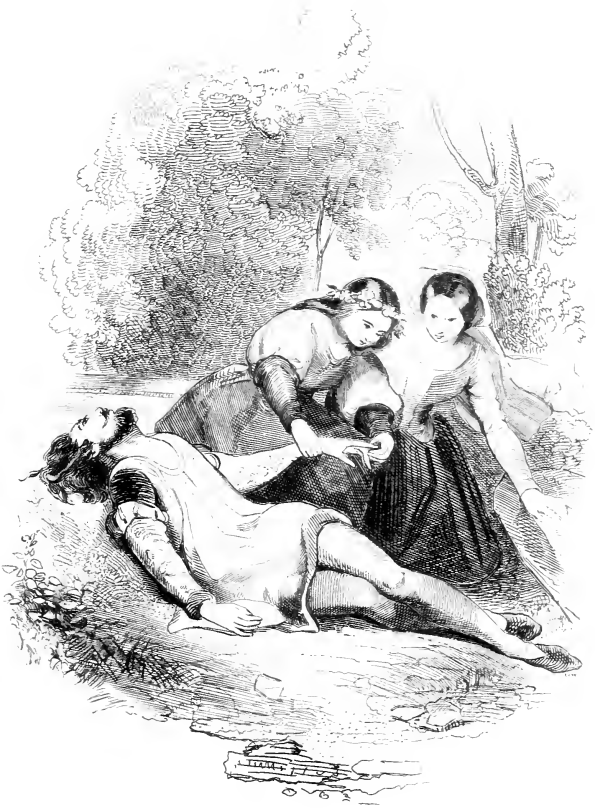
THE FATAL DREAM